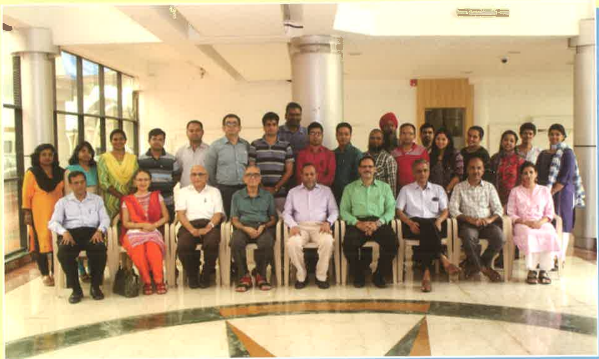
Visiting Students Programme 2018

Refresher Course on Advances in Economics for College/University Faculty : Intensive refresher course on Advances in Economics offered by IGDR faculty and additional special lectures by eminent scholars held from June 25 - July 13, 2018